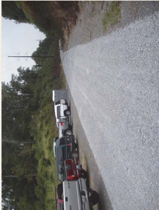
Temporary Parking area at the Fairview Road #2 Trailhead